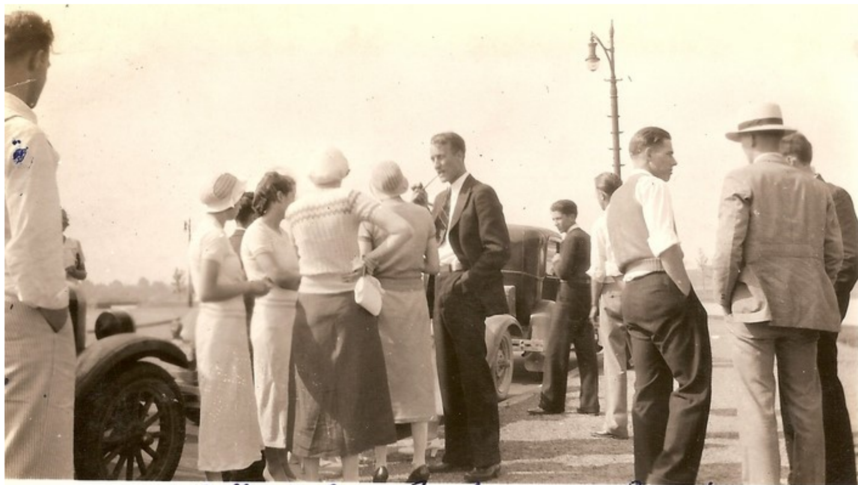
Belle Isle & Bohlo on Bust —